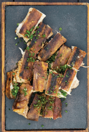
Steak Of The Day