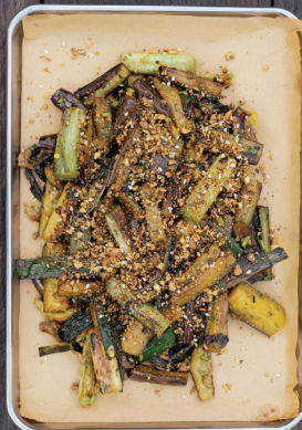
Green Beans & Garlic